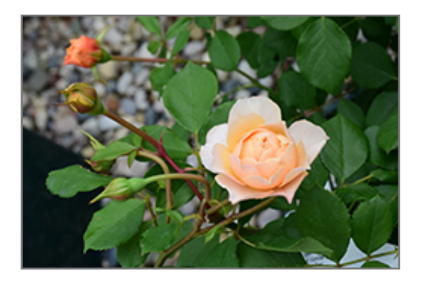
Roald Dahl Rose flowers