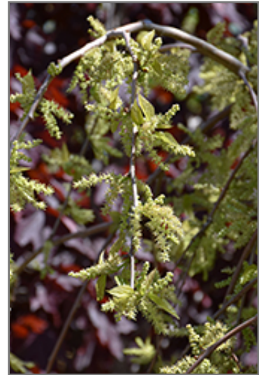
Chaparral Weeping Mulberry flowers

Thank you for choosing Seoane's Garden Center