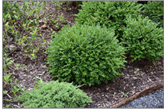
NewGen Liberty Belle Boxwood

NewGen Liberty Belle Boxwood is recommended for the following landscape applications;