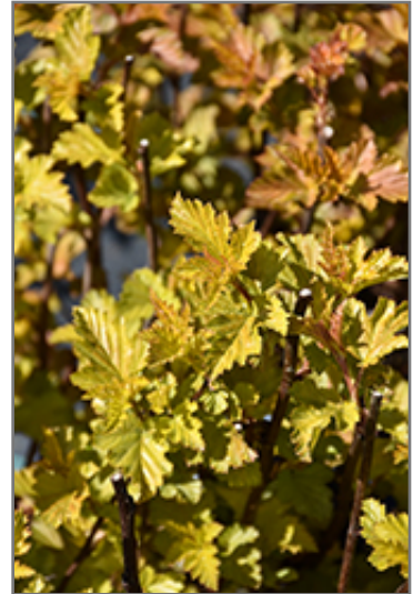
Savannah Sunset Ninebark foliage

This shrub does best in full sun to partial shade. It is very adaptable to both dry and moist locations, and should do just fine under average home landscape conditions. It is not particular as to soil type or pH. It is highly tolerant of urban pollution and will even thrive in inner city environments. This is a selection of a native North American species.