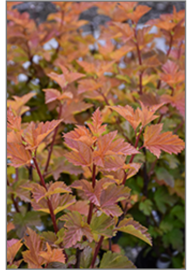
Savannah Sunset Ninebark foliage