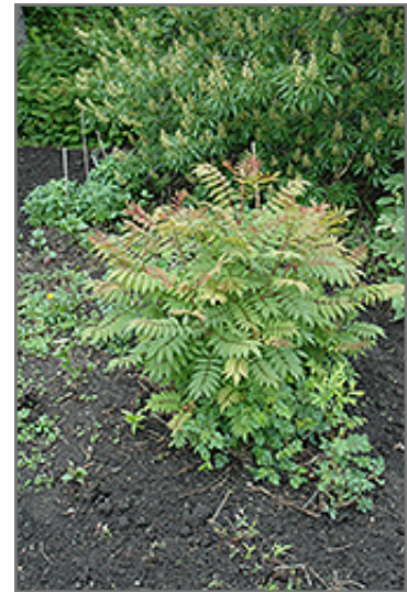
Sem False Spirea

Thank you for choosing Seoane's Garden Center