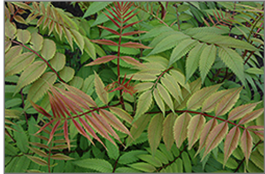
Sem False Spirea foliage