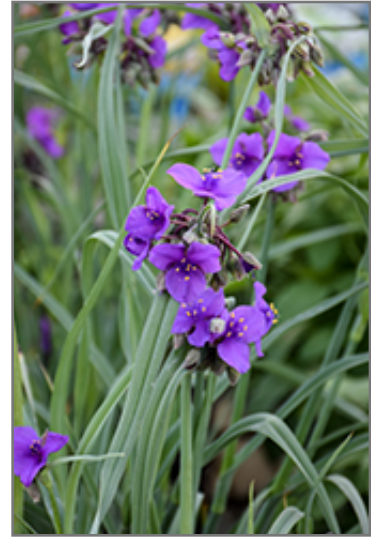
Concord Grape Spiderwort flowers