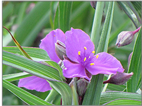
Concord Grape Spiderwort flowers

* This is a 'special order' plant - contact store for details