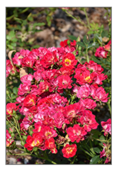
Pink Drift Rose flowers

Pink Drift Rose is recommended for the following landscape applications;