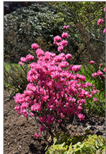
Landmark Rhododendron in bloom

Thank you for choosing Seoane's Garden Center