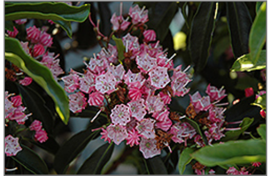
Nathan Hale Mountain Laurel flowers

Nathan Hale Mountain Laurel will grow to be about 8 feet tall at maturity, with a spread of 8 feet. It has a low canopy with a typical clearance of 1 foot from the ground, and is suitable for planting under power lines. It grows at a slow rate, and under ideal conditions can be expected to live for 50 years or more.