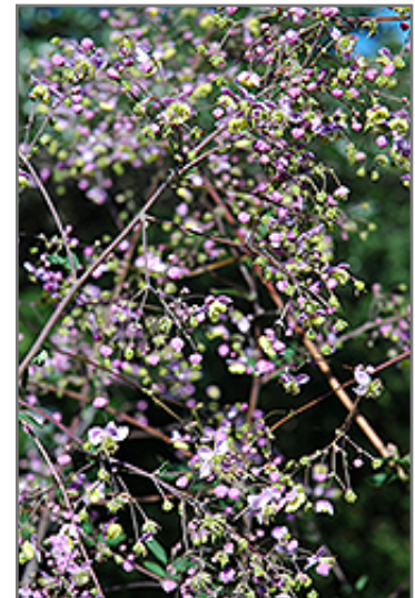
Rochebrun Meadow Rue flowers

Thank you for choosing Seoane's Garden Center