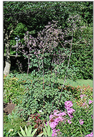
Rochebrun Meadow Rue in bloom

Thank you for choosing Seoane's Garden Center