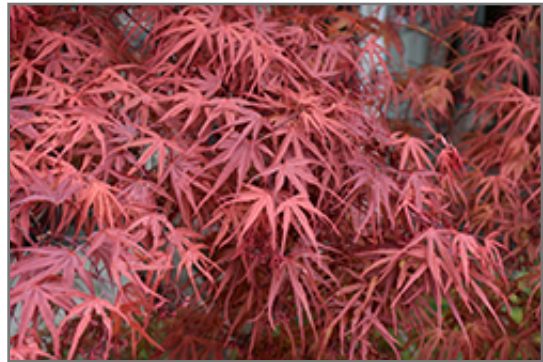
Beni Otake Japanese Maple foliage

Thank you for choosing Seoane's Garden Center