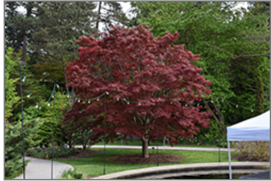
Beni Otake Japanese Maple

This tree does best in full sun to partial shade. You may want to keep it away from hot, dry locations that receive direct afternoon sun or which get reflected sunlight, such as against the south side of a white wall. It prefers to grow in average to moist conditions, and shouldn't be allowed to dry out. It is not particular as to soil pH, but grows best in rich soils. It is somewhat tolerant of urban pollution, and will benefit from being planted in a relatively sheltered location. Consider applying a thick mulch around the root zone in winter to protect it in exposed locations or colder microclimates. This is a selected variety of a species not originally from North America.