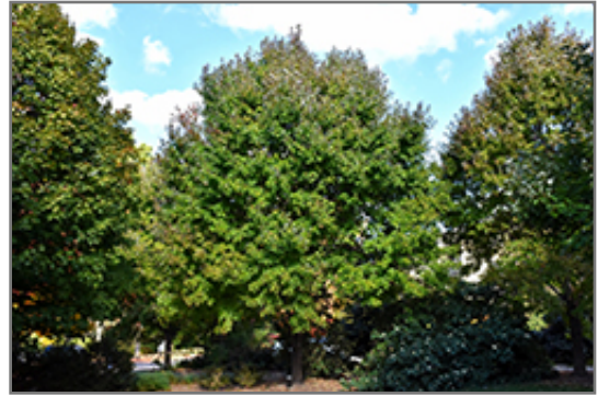
Autumn Flame Red Maple

This tree should only be grown in full sunlight. It is quite adaptable, preferring to grow in average to wet conditions, and will even tolerate some standing water. It is not particular as to soil type, but has a definite preference for acidic soils, and is subject to chlorosis (yellowing) of the foliage in alkaline soils. It is somewhat tolerant of urban pollution. This is a selection of a native North American species.