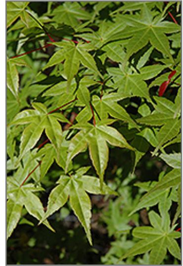
Shindeshojo Japanese Maple foliage

Shindeshojo Japanese Maple is recommended for the following landscape applications;