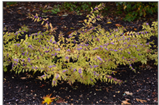
Early Amethyst Beautyberry fruit

Thank you for choosing Seoane's Garden Center