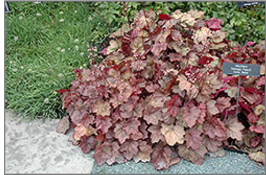
Georgia Peach Coral Bells

Georgia Peach Coral Bells is recommended for the following landscape applications;