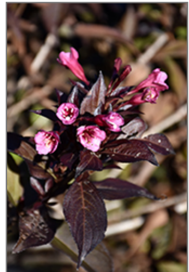
Fine Wine Weigela flowers

Thank you for choosing Seoane's Garden Center