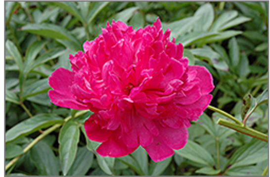
Felix Crousse Peony flowers

Thank you for choosing Seoane's Garden Center