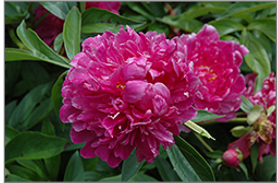
Victoire de la Marne Peony flowers