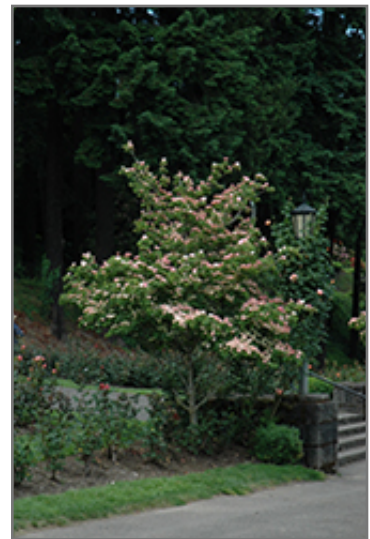
Heart Throb Chinese Dogwood in bloom